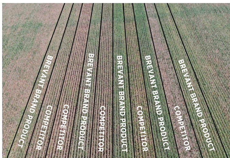
Brevant® brand products demonstrate their agronomic strength in a field in Jefferson County, Wisconsin, infected with tar spot.

Significant yield loss can occur under favorable environmental conditions for disease development. As the name implies, tar spot can be identified by small black and circular lesions. They are slightly raised, and bumps can be felt on affected plant tissue. Lesions can appear on leaves, husks or stalks and are often surrounded by a light tan-colored halo. Lesions are caused by fungal structures called stromata that cannot be rubbed off affected plant tissues.